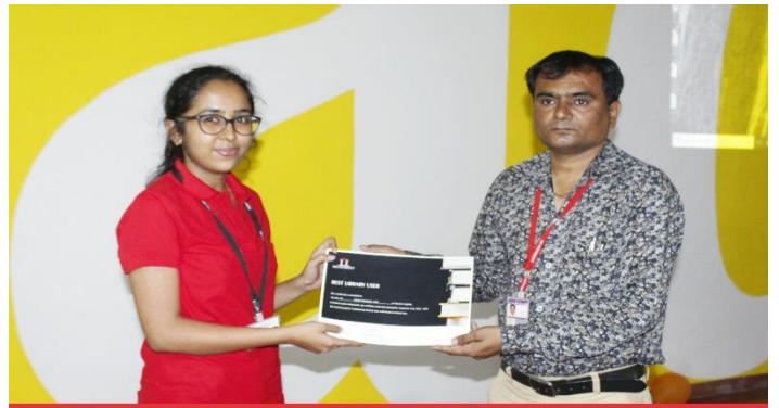
Students & faculty members of RK University celebrated World Book Day at RKU library