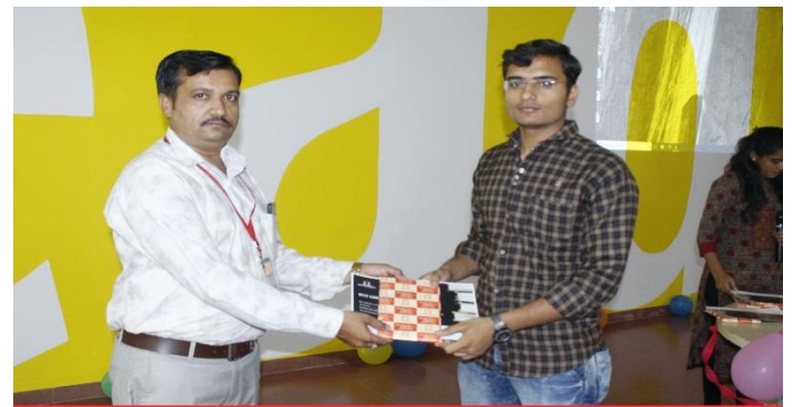
Students & faculty members of RK University celebrated World Book Day at RKU library