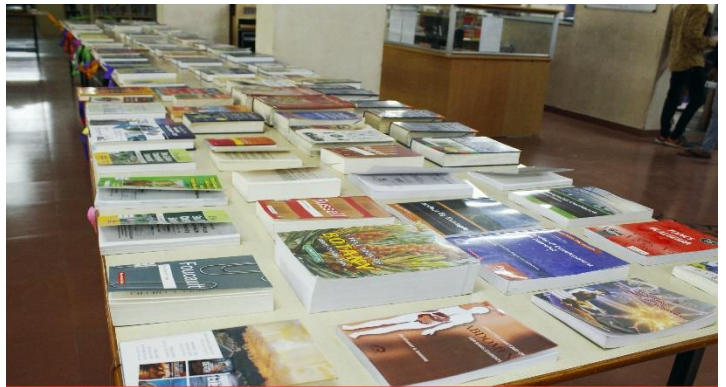
Students & faculty members of RK University celebrated World Book Day at RKU library