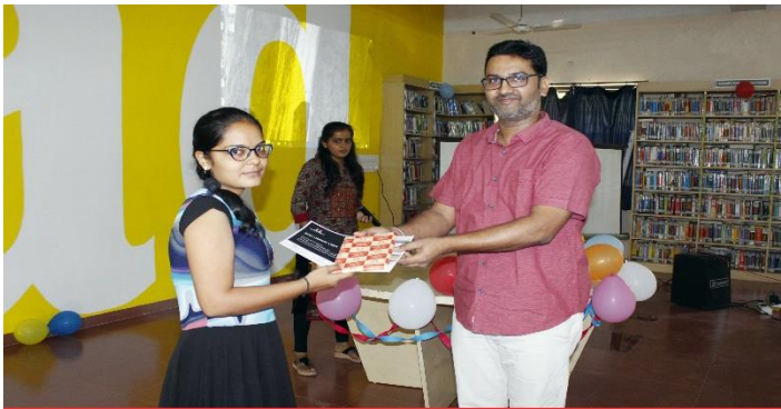
Students & faculty members of RK University celebrated World Book Day at RKU library