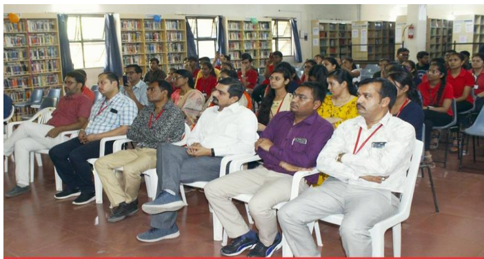
Students & faculty members of RK University celebrated World Book Day at RKU library